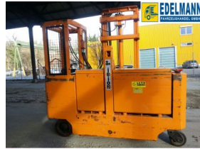
Visit us under www.e-truck.ch