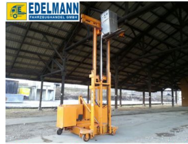
Visit us under www.e-truck.ch