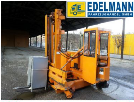
Visit us under www.e-truck.ch